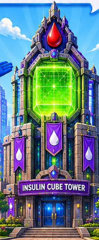
INSULIN CUBE TOWER